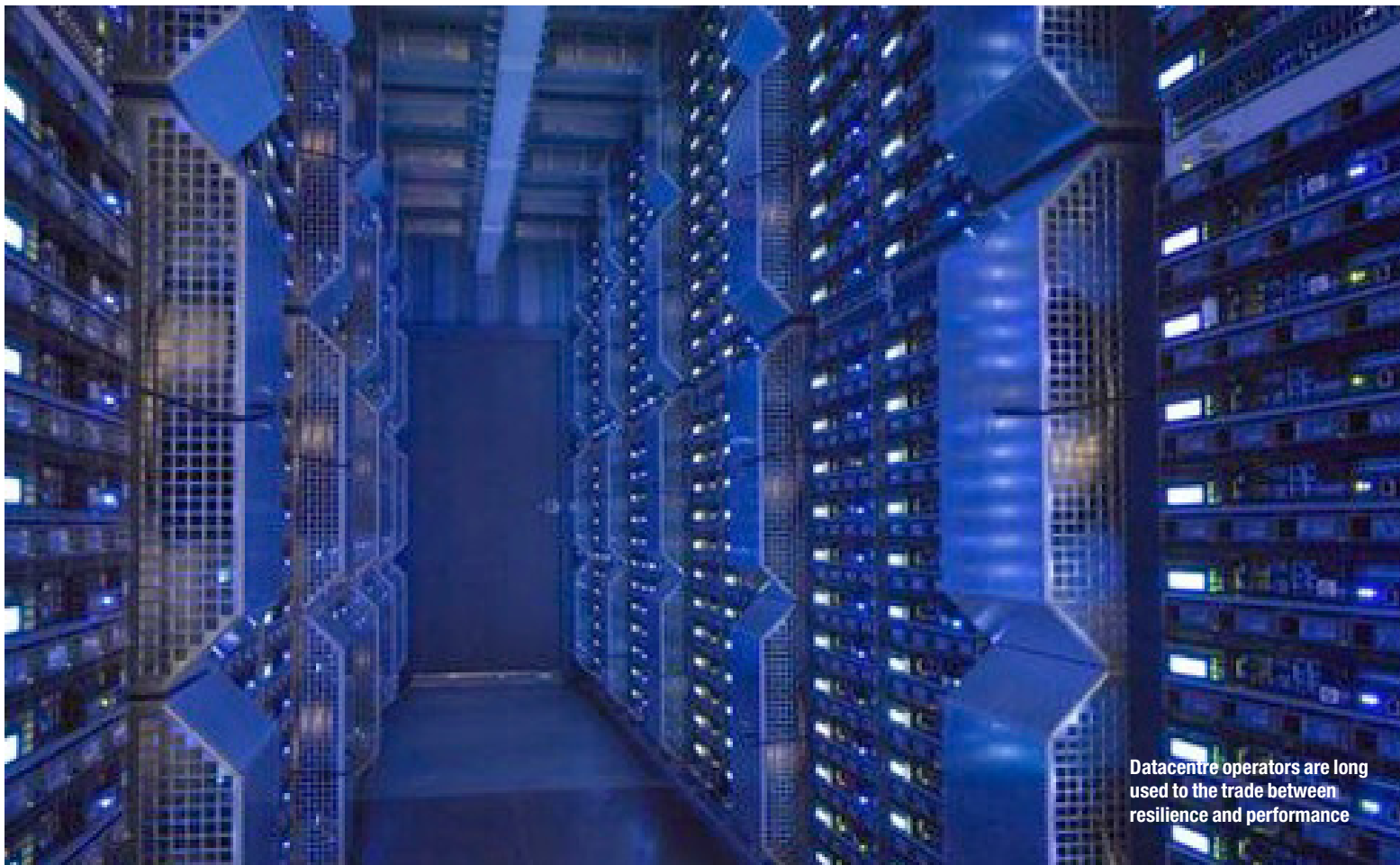
Datacentre operators are long used to the trade between resilience and performance